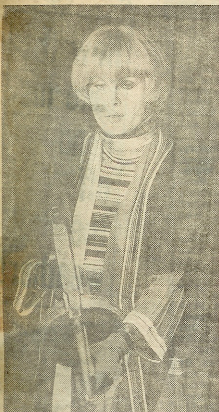
JOANNA LUMLEY . . . the new girl with no head for heights