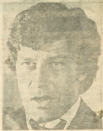
PATRICK MACNEE: Original GARETH HUNT: Tough