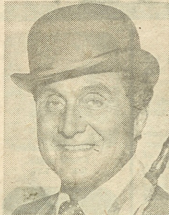
PATRICK MACNEE: Original

It will be shown on Tuesday in the London and Anglia regions, and on Friday in the rest of the country.